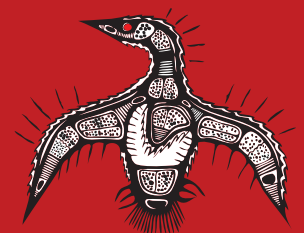
Peter Gzowski College